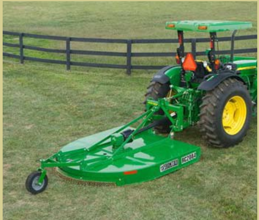
The new RC2084 offers greater cutting width and enhanced productivity. With a large, rugged gearbox, 3/4-inch gearbox mounting plate, and tubular top deck bracing, the RC2084 provides unbeatable strength, durability, and performance.