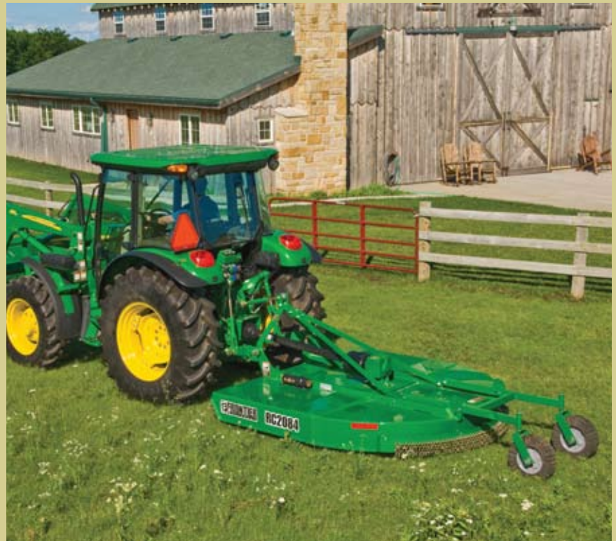
The RC20 Series Rotary Cutters feature 4- to 7-foot cutting widths for fast, efficient mowing in a variety of conditions and are compatible with tractors from 18 to 90 horsepower.